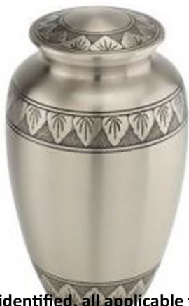
Athena Pewter AH 719

Engraving Available on most urns $ 20.00 Stock varies from time to time