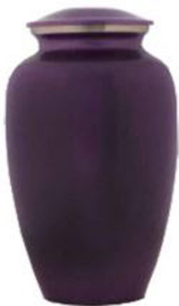
Celestial AH 720

Local Supplier CFCS Sand Cast Brass Height 10" Diameter 6"