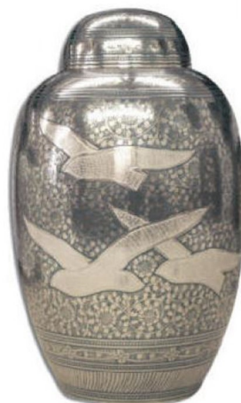
Going Home AH824