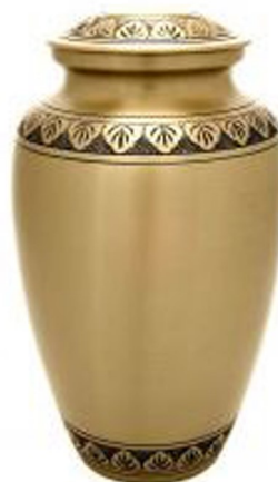
Athena Bronze AH819